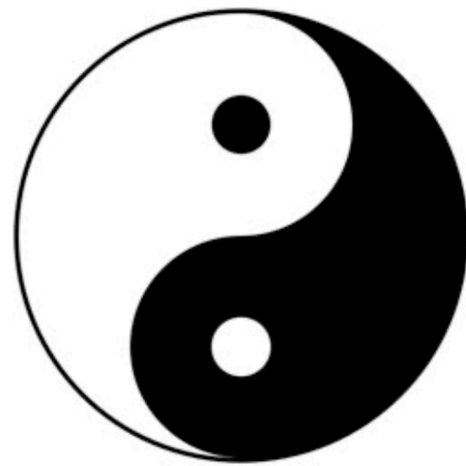
FLOATING MOUNTAIN - Mountain Top Tea Circle

The moral person will act out of duty, and when no one responds will roll up his sleeves and use force.